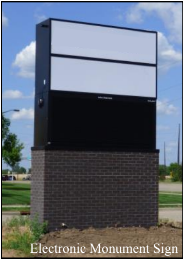
Electronic Monument Sign