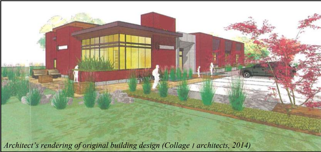
Architect's rendering of original building design (Collage 1 architects, 2014)

Building ..... 6,100 SF on Main & 3,040 SF LL (approx.) Site ..... 1.74 Acres Year Built ..... 2014—New Construction Zoning ..... C-3 (General Commercial District) Traffic Counts ..... 17,100 vpd at Dodd Rd & Cedar Ave Signage ..... Electronic Board on Monument Sign Dakota County Real Estate Taxes ..... $31,441 (2014) Listing Price ..... $950,000