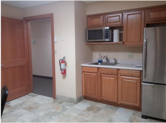
Break Room with full fridge and microwave

5885—149th Street West, Apple Valley, MN 55124