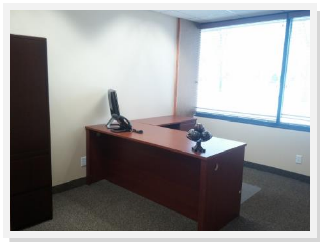
Furnished Office Suites