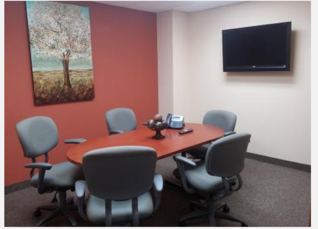
Conference Room—with video conferencing